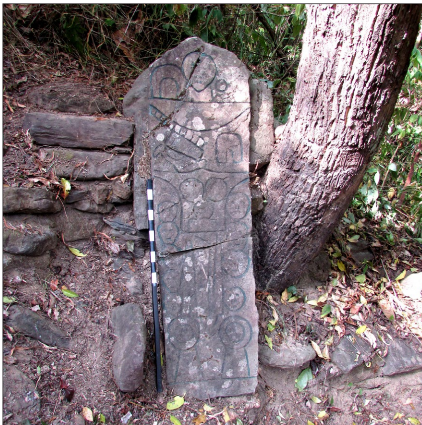
Figure 11: Reclining menhir at Chawngvungi Lungdawh.