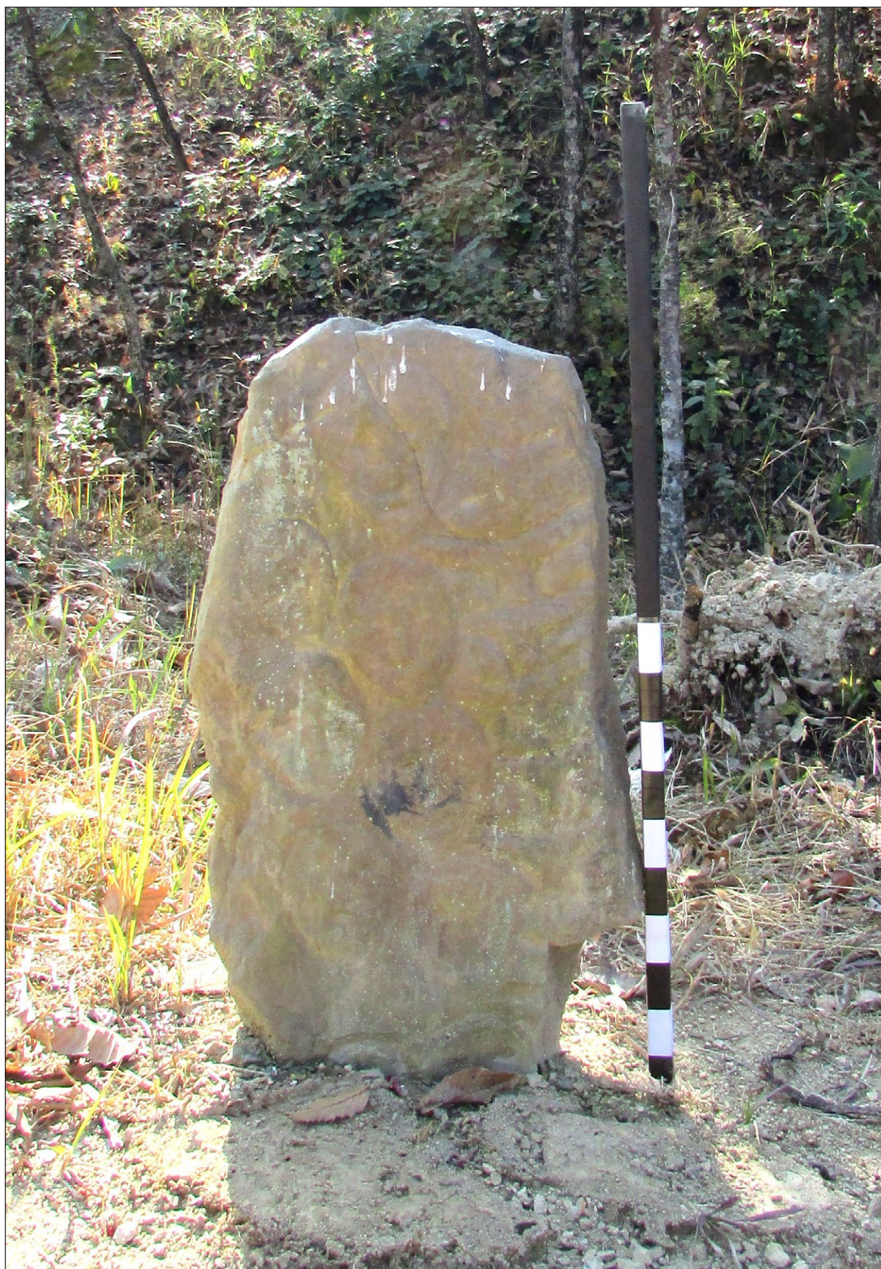
Figure 3: Lung Hmel Pu (Stone Containing Faces).