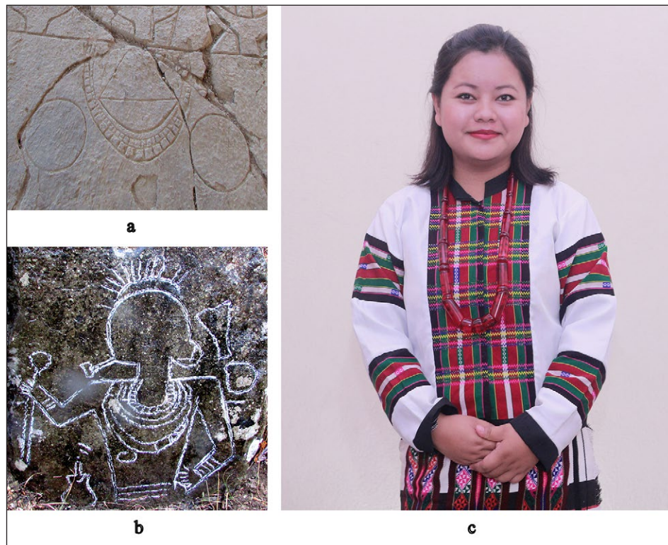
Figure 13: Bead necklace: (a) & (b) Depictions of bead necklaces (c) A Mizo lady in traditional attire wearing a bead necklace (Courtesy: Lalhmangaihi Chhakchhuak; image c).