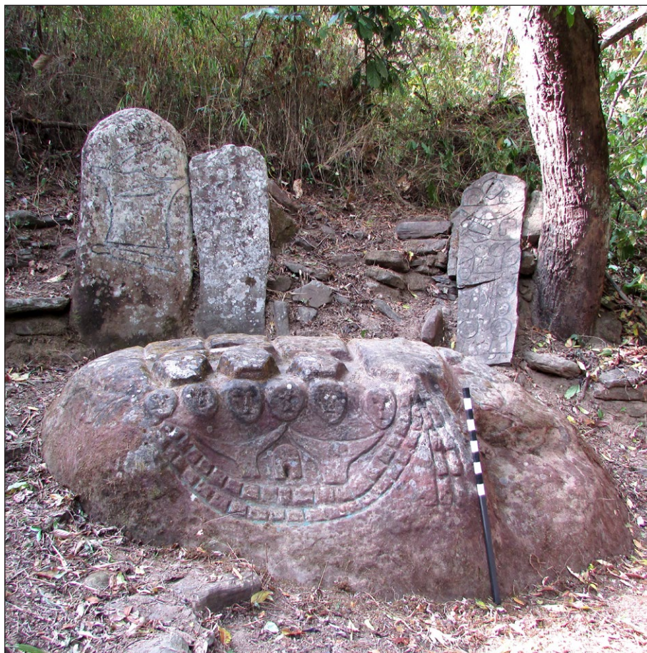
Figure 8: Chawngvungi Lungdawh.