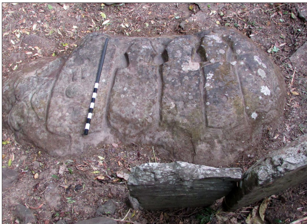
Figure 9: Chawngvungi Lungdawh (view from top).