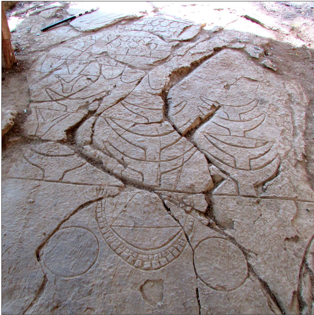
Figure 4: Lungkeiphawtial.

Farpui Tlang Reserve Lungphun (Farpui Hill Reserve Menhirs) (Fig. 6): The menhirs are located on top of the Farpui Tlang which is close to the Indo-Myanmar border. It is located about four km from Farkawn village. There are many menhirs some of which have fallen. At the center are two menhirs which have incised depictions with a stone platform. The taller menhir has three depictions while the shorter menhir has eight depictions. The depictions are bovine head, probably of mithun/gayal, blades, animal horn, geometric and unknown symbols etc. Lungkeiphawtial River flows at the base of the hill which joins the Tiau River .