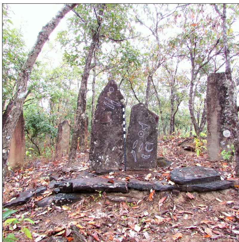
Figure 6: Farpui Tlang Reserve Menhirs.