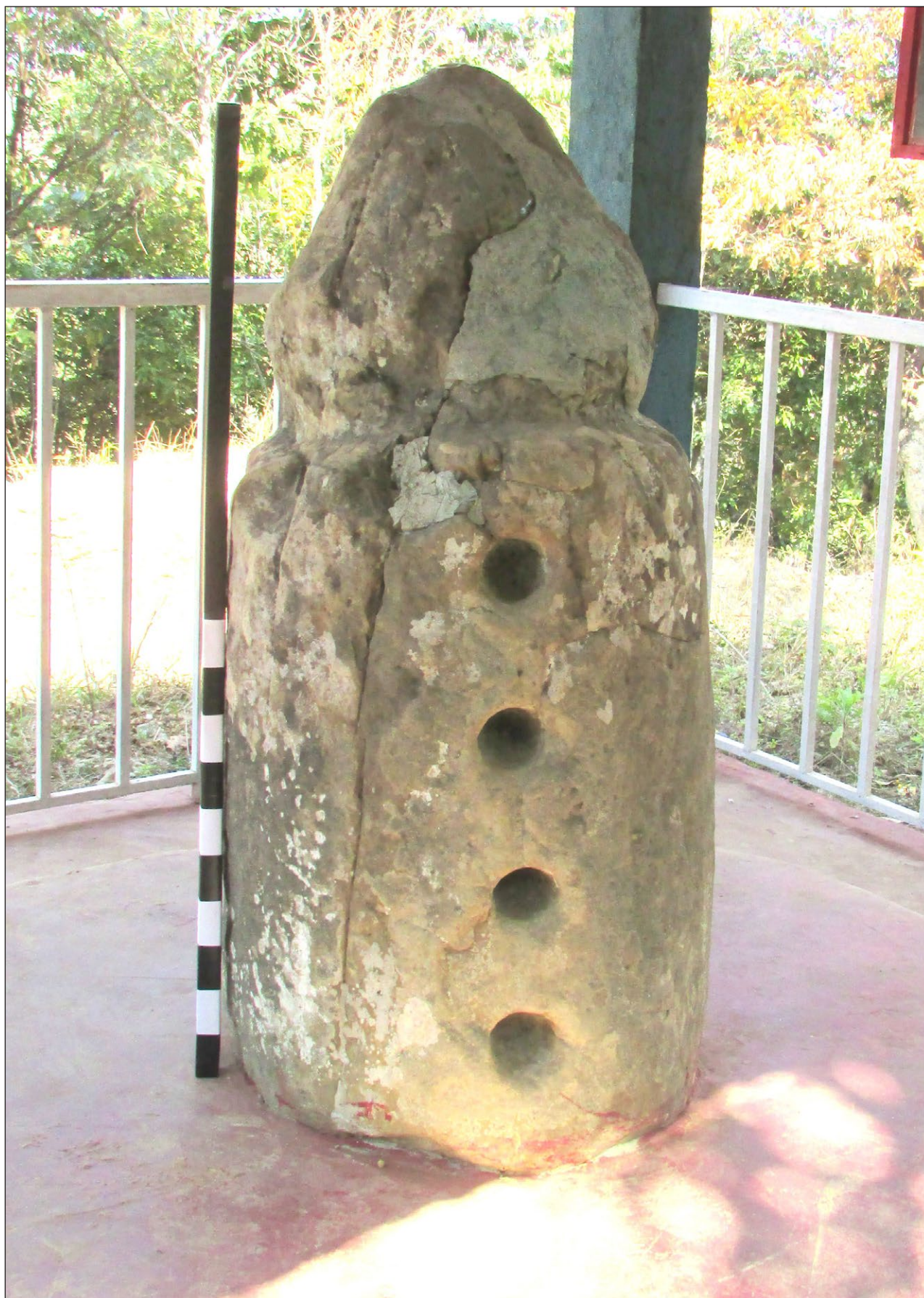
Figure 2: Chhura Chi Rawt Lung.