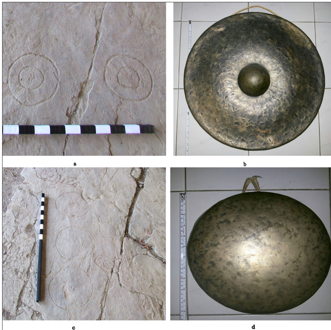
Figure 12: Copper bell: (a) Darkhuang, (b) contemporary of (a), (c) Darmang, (d) contemporary of (c)

It is also equally interesting to note that though many of the megalithic monuments found in these two villages are associated with deceased people, as is the generic understanding of the relationship between megaliths and burial customs, few are built to commemorate events related to personal feelings of the living. As for an example, the megalith of Darthiangi Lung which symbolizes the deep love between a deranged couple who couldn't be together and