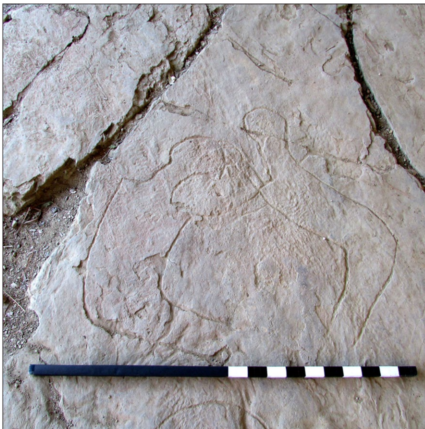
Figure 5: Tiger marks at Lungkeiphawtial.