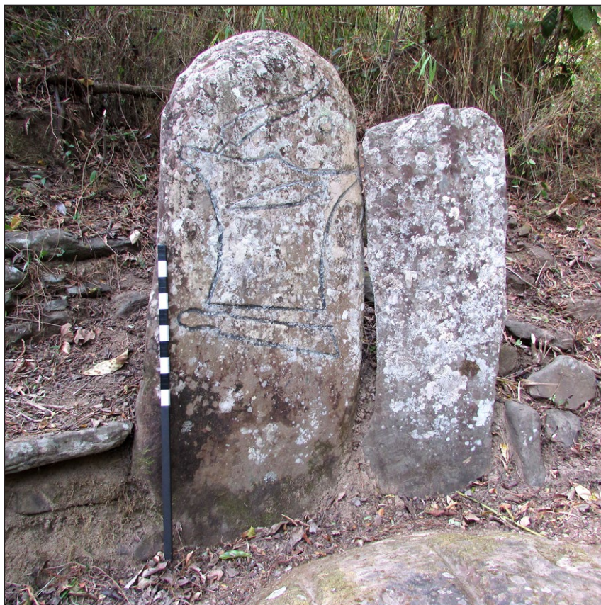
Figure 10: Standing menhirs at Chawngvungi Lungdawh.