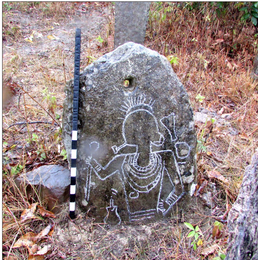
Figure 7: Darthiangi Lung.